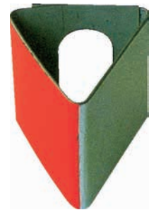
Type V reflector