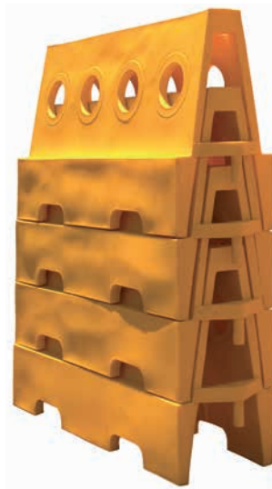
28 kg waterfilled barrier