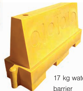
17 kg waterfilled barrier