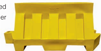
6 kg waterfilled barrier